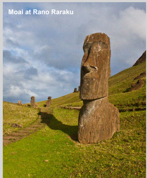
Moai at Rano Raraku

We invite you to get to know the mysteries of Rapa Nui in the best place, Cabañas Morerava.